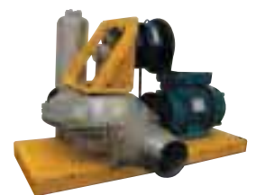
DP3E shown without cover fitted