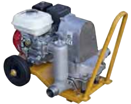
SMD50HT TROLLEY MOUNTED