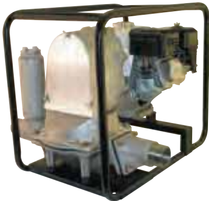
SMD50X IN CRASH FRAME